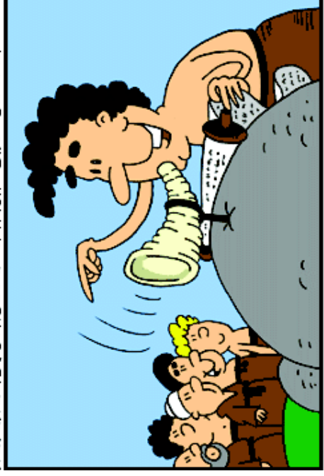
I'M CASSIUS CASSIUM AND I'M COUNTING DOWN THE TOP FORTY PSALMS

- From the Women of Faith Study Bible , NIV